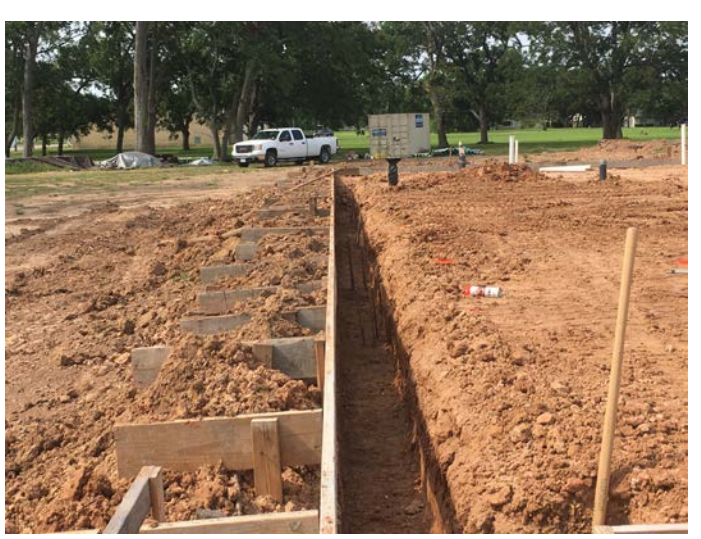
2. Excavation of grade beams for slab on grade